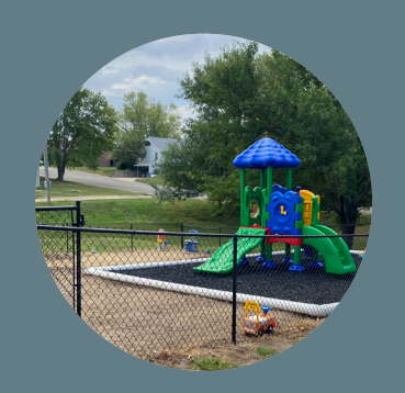
Jewell County Strong: Daycare