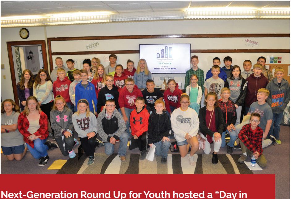
Next-Generation Round Up for Youth hosted a “Day in Towne” to fifth grade students in Jewell County.